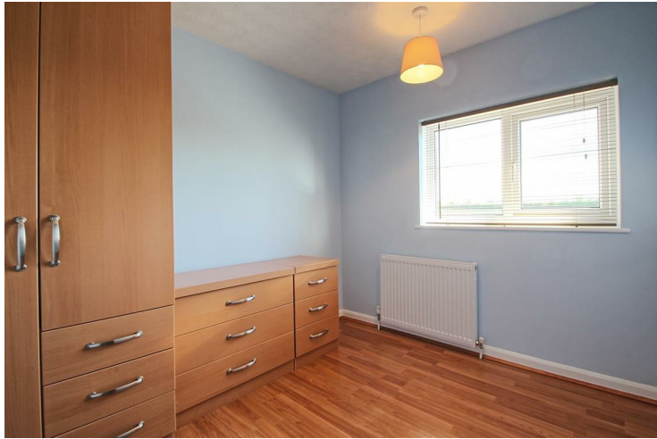
BEDROOM FOUR 10'0" x 7'10" max (3.05 x 2.39 max)